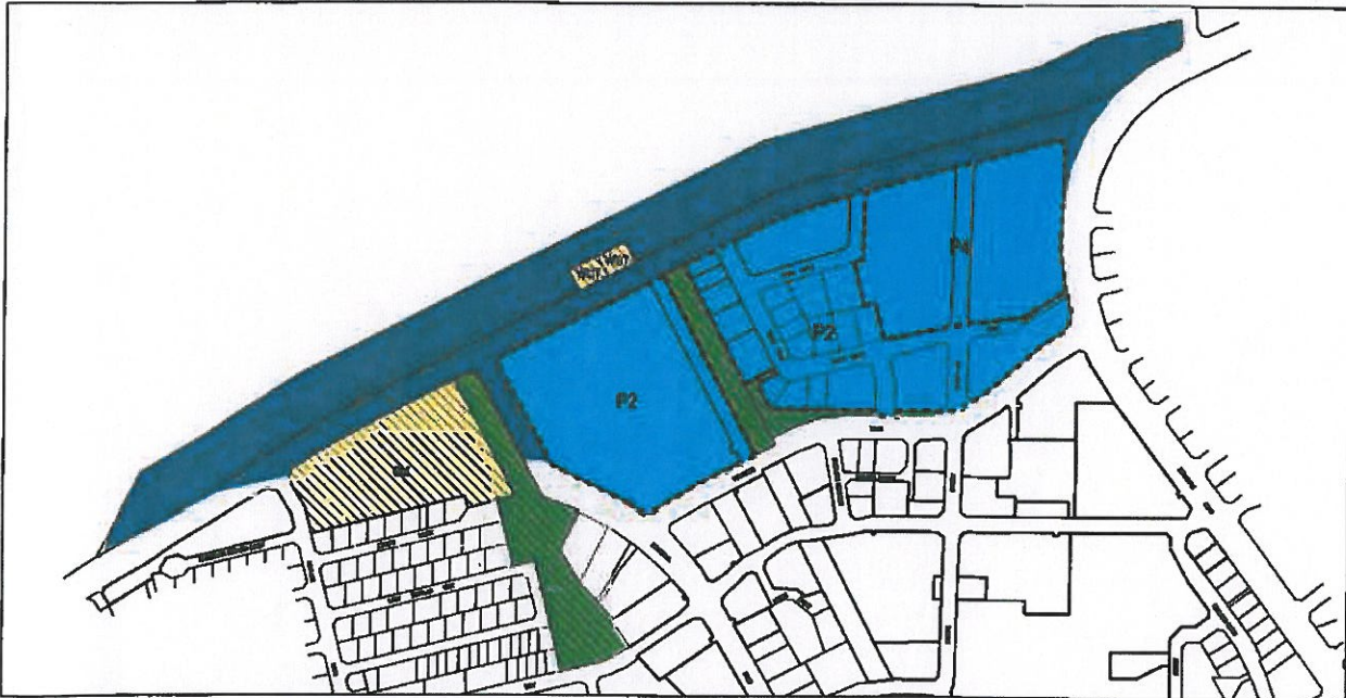
SHIRE OF ROEBOURNE TOWN PLANNING SCHEME No. 8 - PROPOSED EXISTING ZONES AND RESERVATIONS