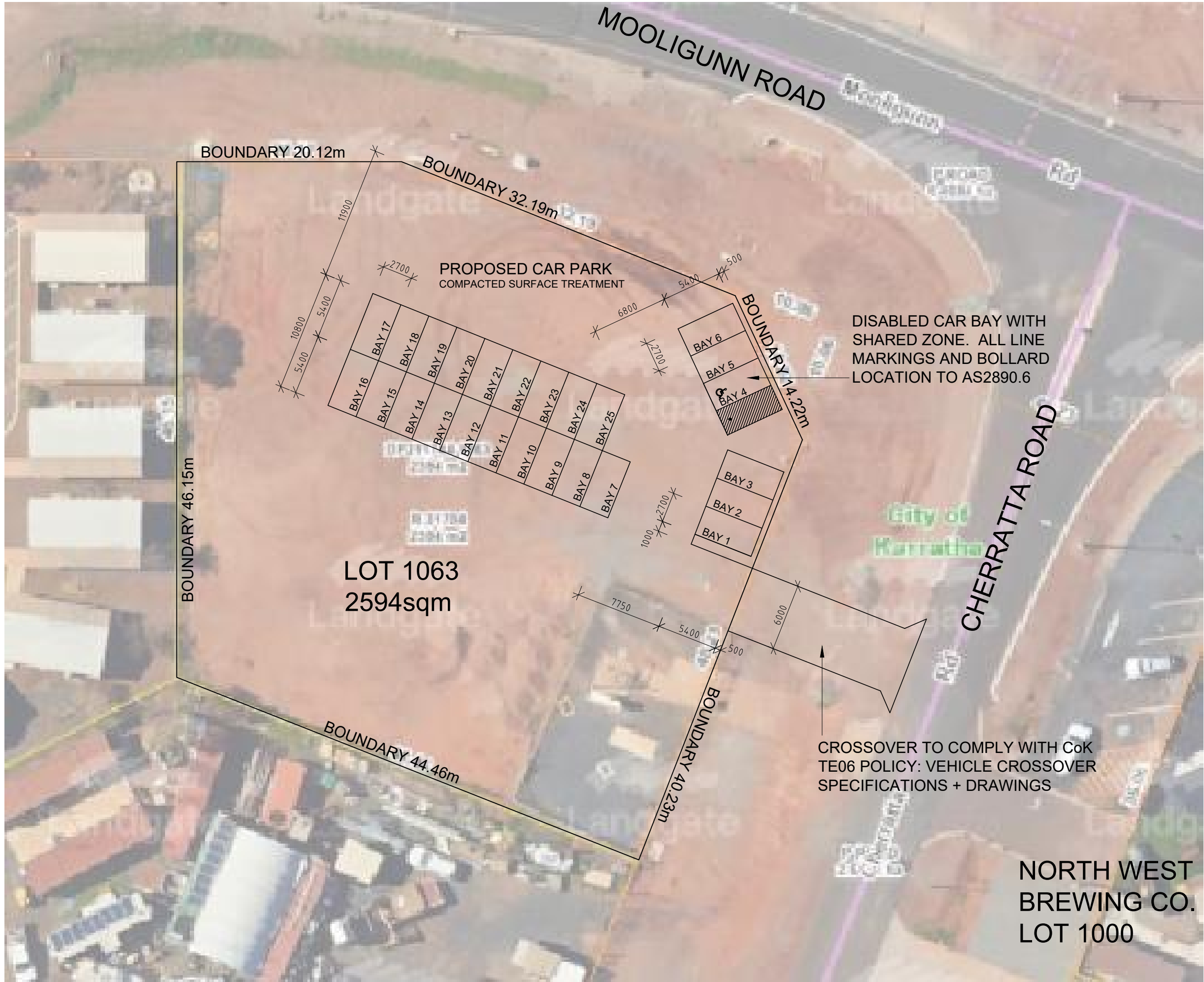
A0.0.1 SITE PLAN SCALE 1:300